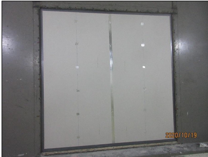
Photo No. 1 Receive Room View of Installed Specimen