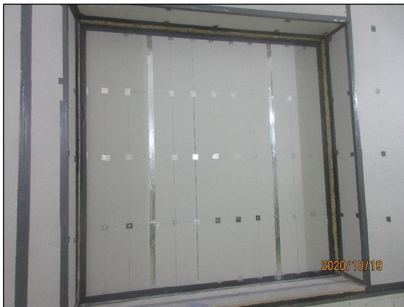
Photo No. 2 Source Room View of Installed Specimen