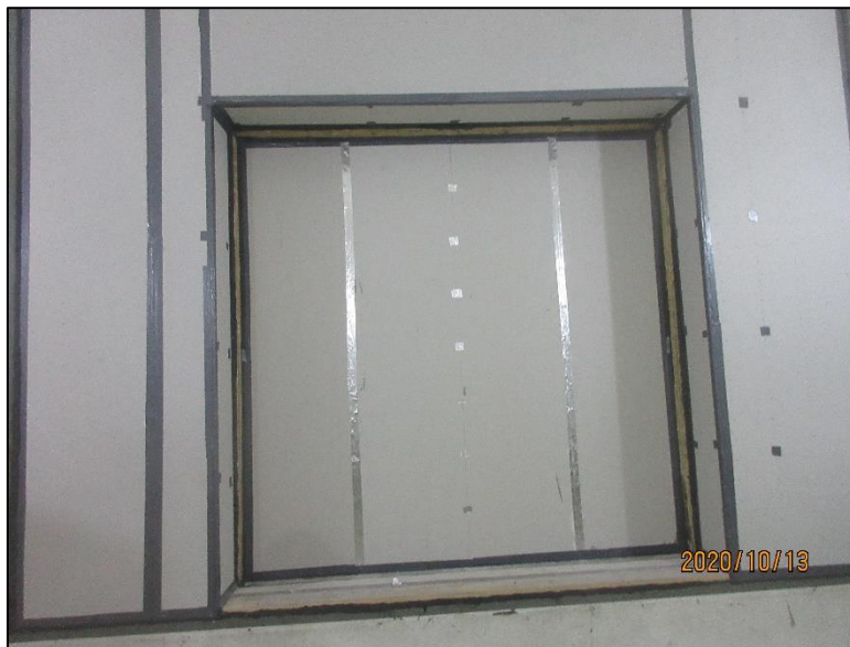
Photo No. 2 Source Room View of Installed Specimen