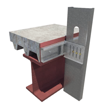
Drift Rail (DR) Installation