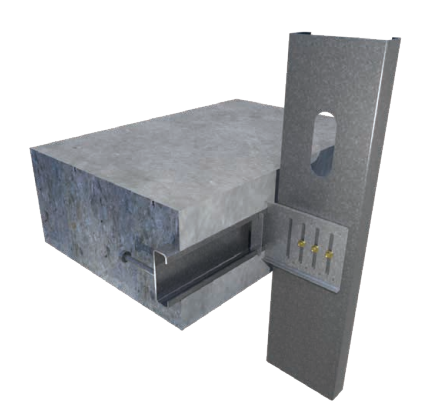
Drift Headed Rail (DHR) Installation