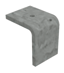
Drift Locking Angle (DRLA)